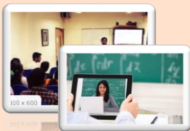
Flexibility of Online/Offline Classes