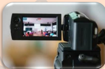
Video recorded classes